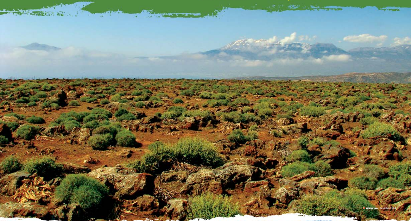
1 Lithino cape - Pteridaki, Lassithi