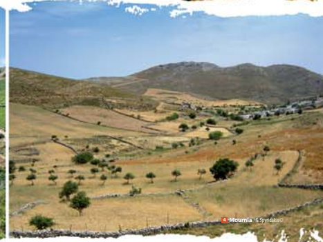
4 Mournia - E. Sythiaki