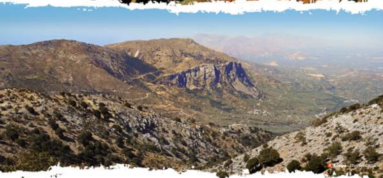
2 Konia - Epano, Lassithi