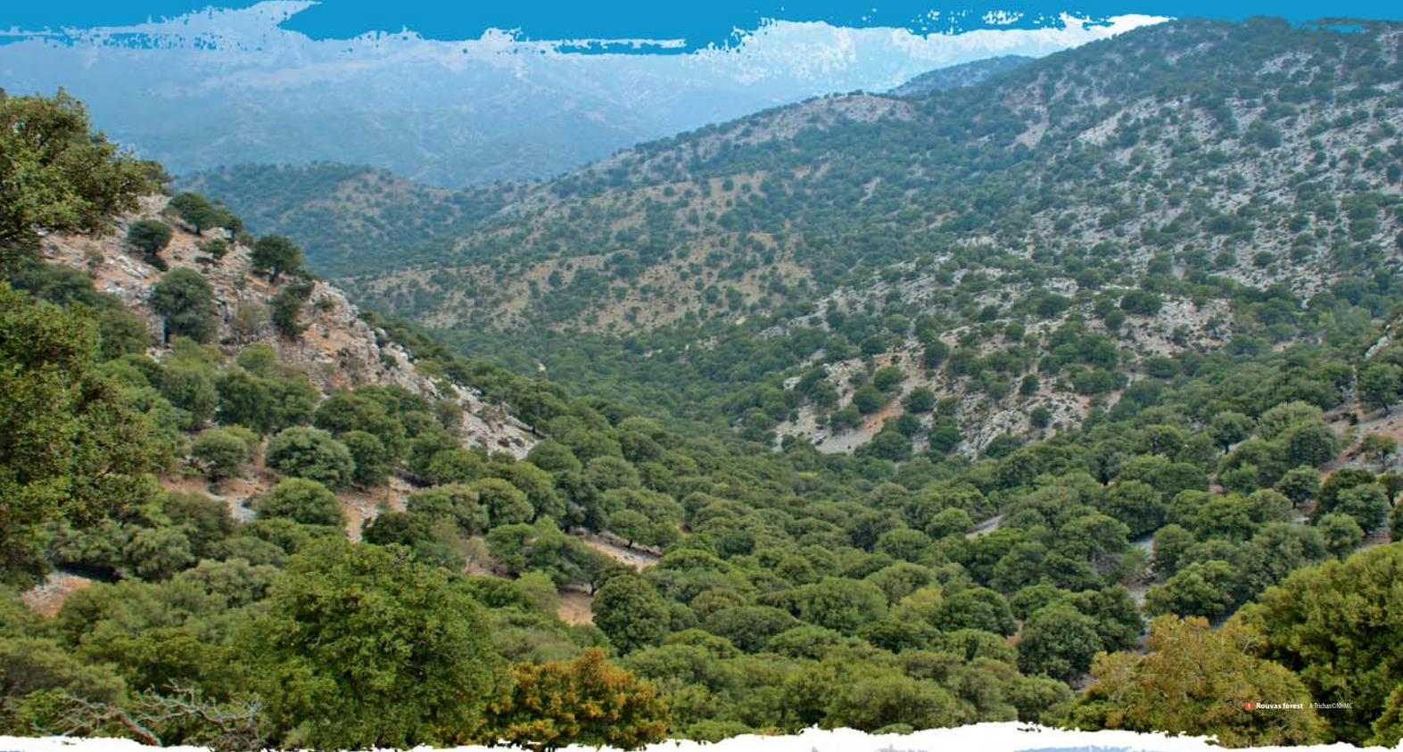
1. Rouvas forest