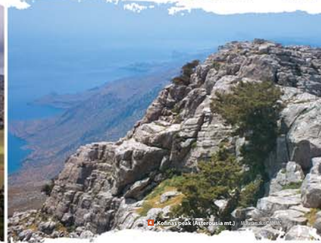
4. Kotina Peak (Asterousia mt.)