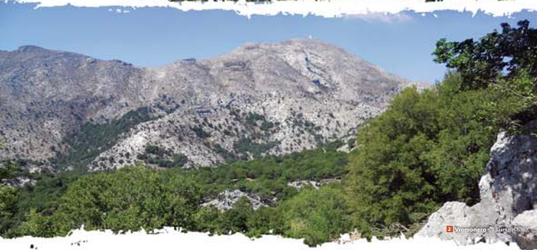
2. Vromonero