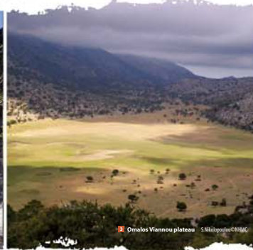
3. Omalos Vionnou plateau