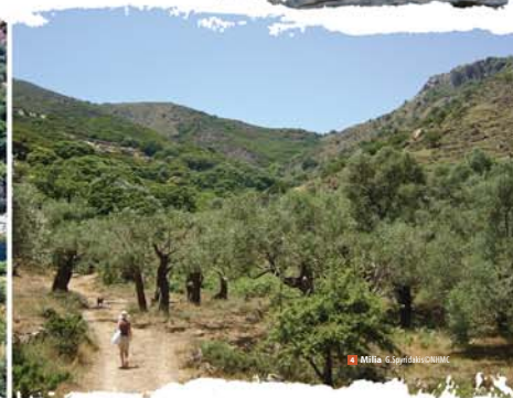
4 MIRA, G. Papadimitriou/NTMC