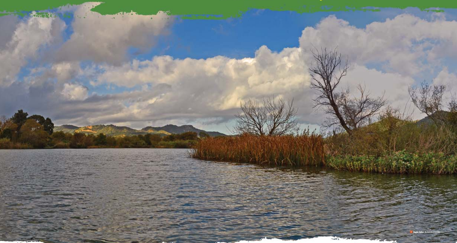
1 Agia lake