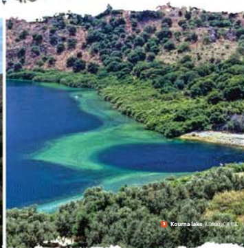
3 Kourna lake