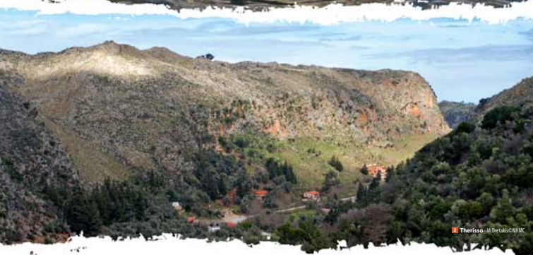
2 Therisso, M. Delatzi/NTMC